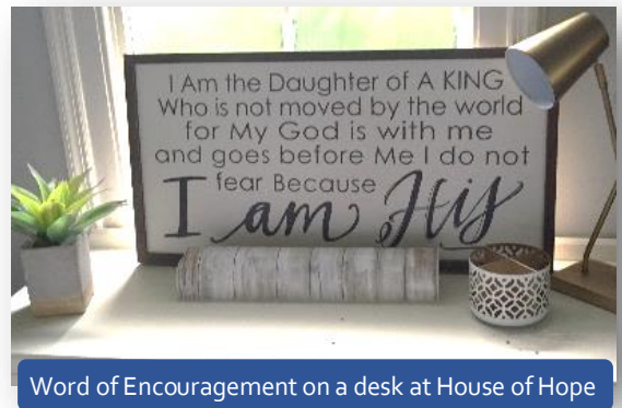
Word of Encouragement on a desk at House of Hope